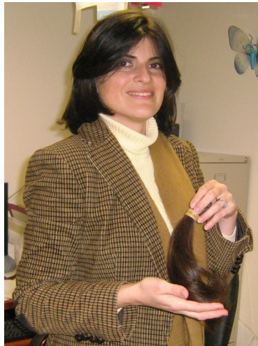
YWPA Student Counselor show cases her own souvenir from her Locks of Love donation.

On June 27, 2009 I went to a hair salon to cut my hair in order to donate it to Locks of Love. This non-profit organization consists of providing hairpieces to